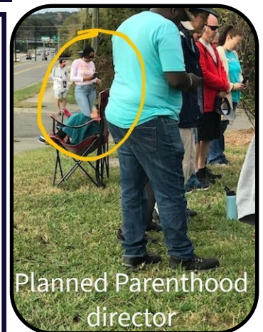
Planned Parenthood director

We're still serving and training other pro-life workers to speak in churches and lead prayer walks. Our "Love Life" team has seen over 100 babies rescued from abortion this year! Since the overturning of Roe V Wade, North Carolina has seen an increase in abortions because people are coming from other states, so we need to continue to pray & be present at these abortion centers. One day the director of Planned Parenthood came out & stood next to our prayer group as a pastor was reading, "God is patient and not willing that anyone perish but that all should come to repentance" 2 Peter 3:9. I told the pastor she's never done that before. That was pretty cool.